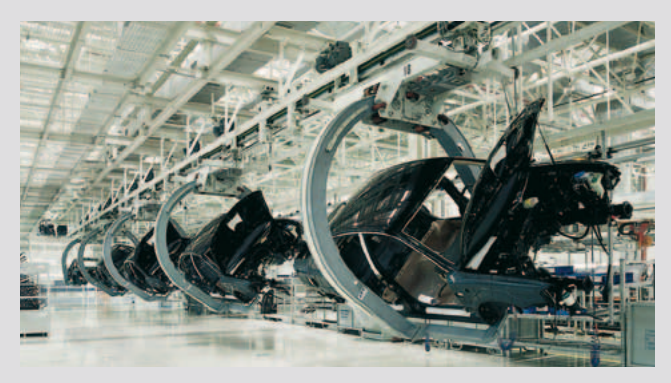
For position determination of telpher lines, e.g., in the automotive industry